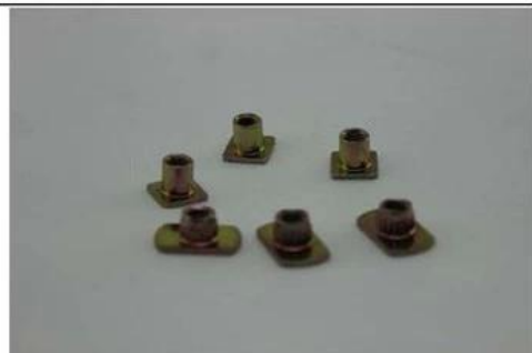
5. Product :