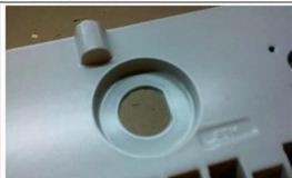
14. Defect-Poor painting