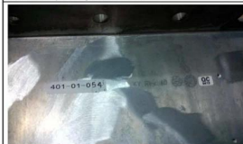
13. Defect-poor label