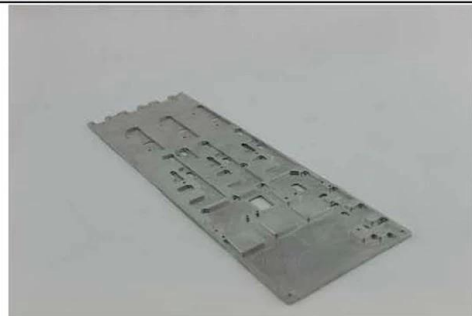
5. Product :