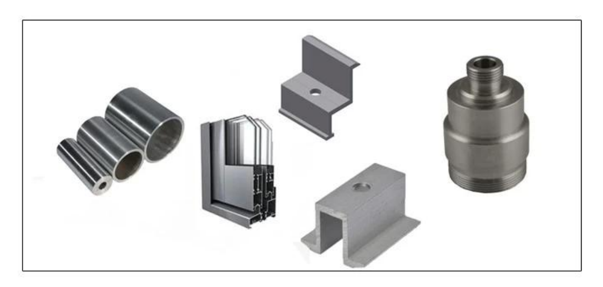
High precision processing technology