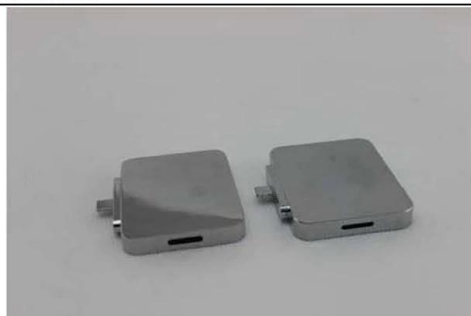
5. Product :