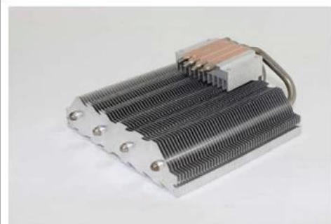
5. Product :