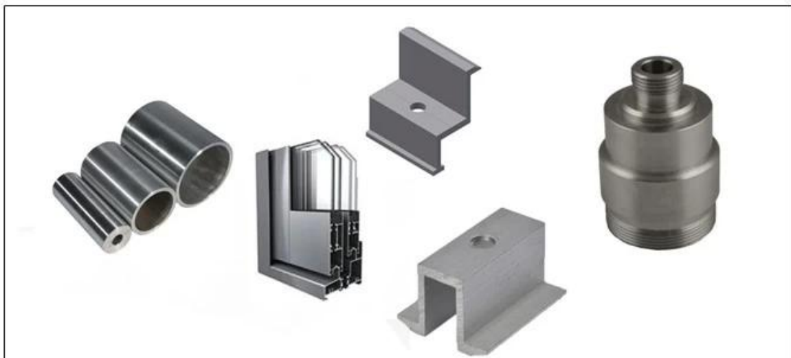
High precision processing technology