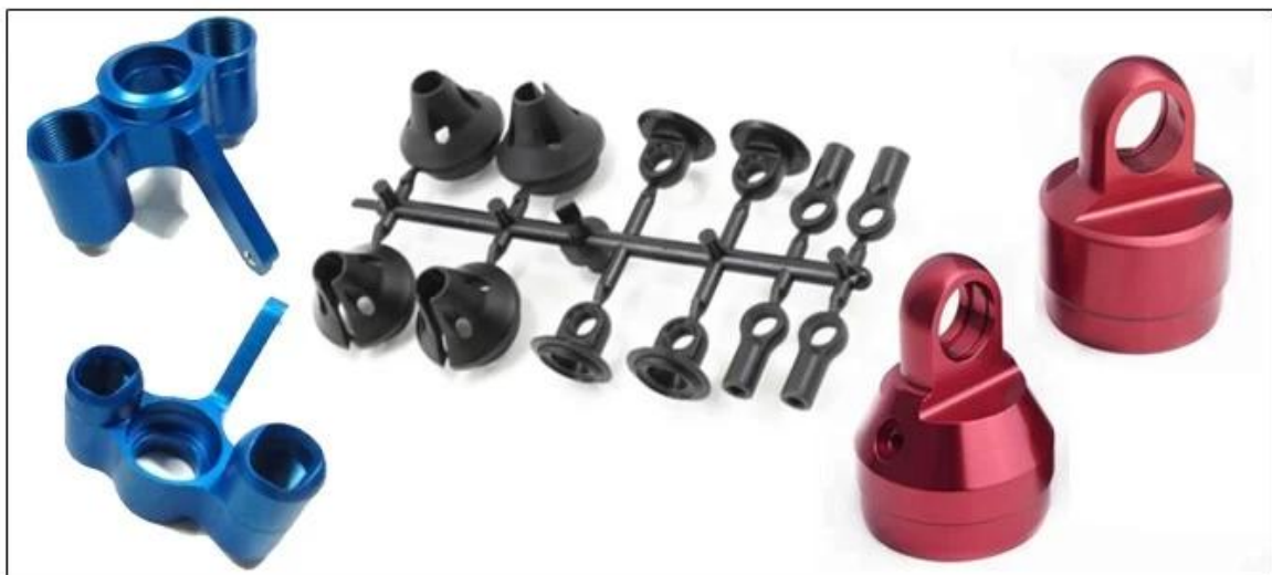
High quality surface treatment