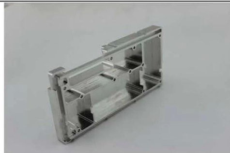
5. Product :