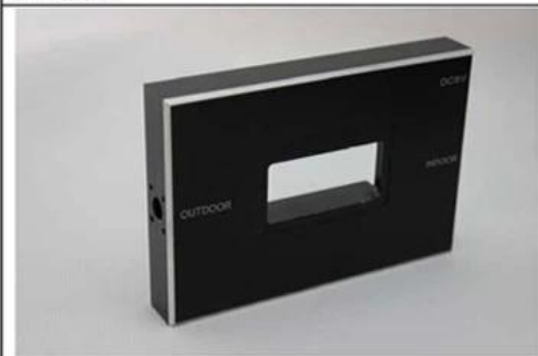
5. Product :