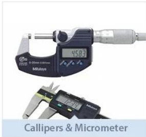
Callipers & Micrometer